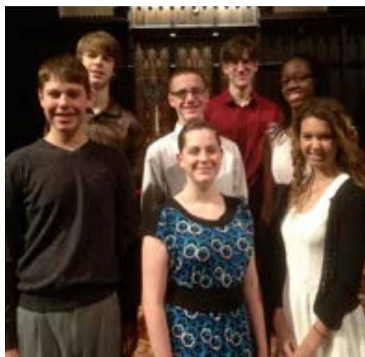
The 2013 Confirmation Class was received into membership on Sunday, March 10.